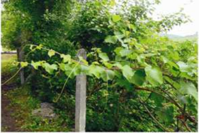
Fig. 9 Cissus vitiginia habit