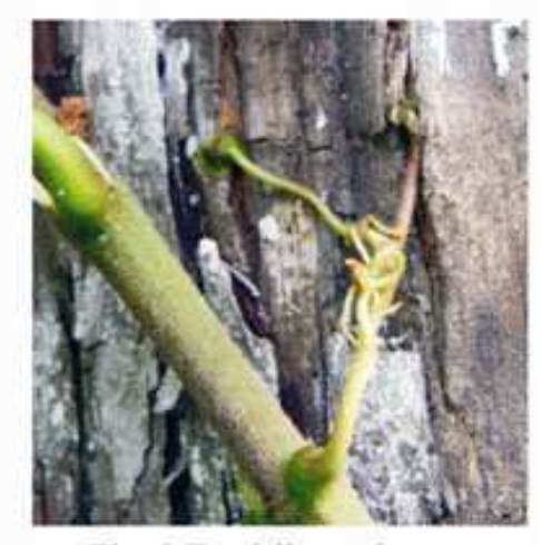
Fig. 8 Tendril attachment