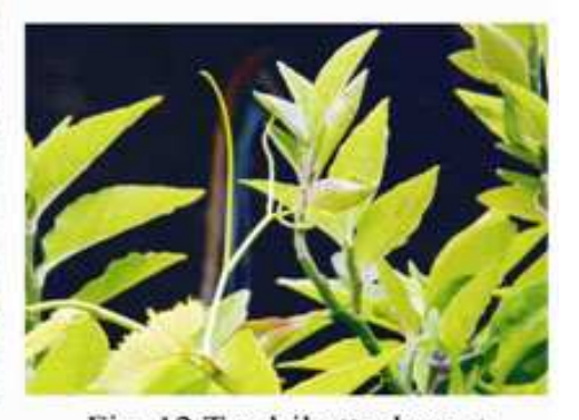
Fig. 12 Tendril attachment