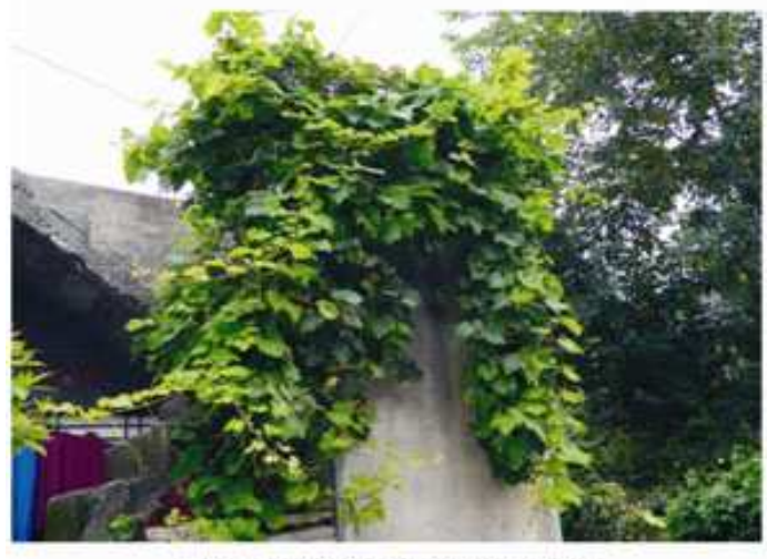
Fig. 11 Vitis venifera habit