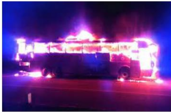
Figure 2: EV Busses caught fire and totally buried.