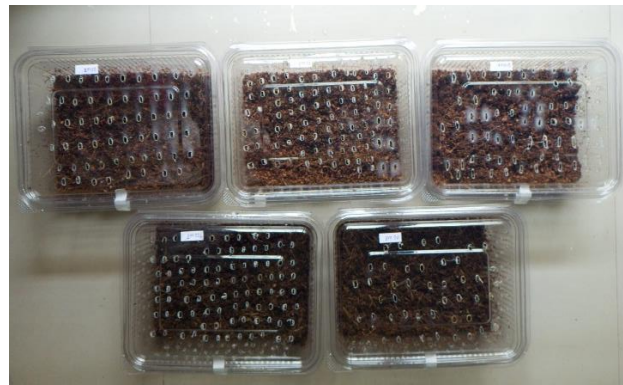
Vermicompost bed at different concentration