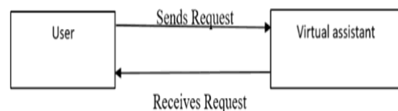
Fig: Action Integration Module.